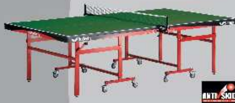
B4-15 Octet Rollaway 25

Used in many international tournaments. Selected for the English Nations Championships. 25mm playing surface with Anti Skid technology. Folds away easily for storage. Available in green or blue.