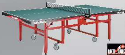
B4-16 Centrefold Rollaway 25

Top quality model ideally suited for the club or sports centre. 25mm playing surface with Anti Skid technology, strong undercarriage. Available in green or blue.