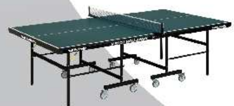
B4-13 Match 22 Rollaway

New in the Butterfly range, the ideal table for the school or club. 25mm top quality playing surface. Strong undercarriage features a quick and easy fold away eight wheel mechanism. Available in green or blue.