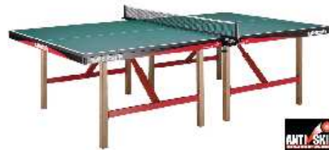
B4-2 Europa 25

Top quality model ideally suited for the club or sports centre. 25mm playing surface with Anti Skid technology, strong undercarriage. Available in green or blue.