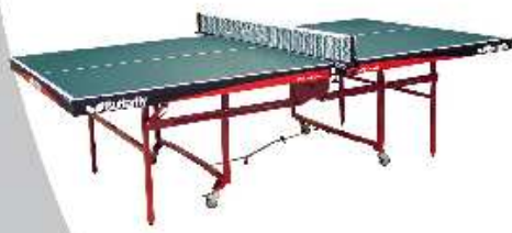
B4-6 Space Saver Rollaway 25

High quality, heavy duty match table designed for clubs or sports centres where the ease of putting tables up and down is a priority. 25mm Ant Skid surface provides optimum bounce and consistency. Available in green or blue.