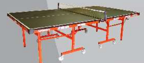
B4-17 National League Rollaway 25

The most popular rollaway table in the Butterfly range. Well suited to tournament or club play. Strong undercarriage and the rollaway system means the table can be put away quickly and easily. Available in green or blue.